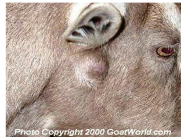
Figure 9 Abscess in a goat.

Treatment: The abscesses should not be opened within the vicinity of the other animals . Isolate affected animals for treatment. If possible, it is recommended to have the abscesses surgically removed to reduce contamination of the environment. If the abscess(es) has/have already ruptured, the animal should be isolated, the abscess flushed with an antiseptic solution (3% iodine or 2% chlorhexidine) and packed with antiseptic saturated gauze ( it is best to seek the help of your veterinarian ).