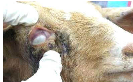
Figure 4 Cloudy cornea of the eye in a goat. Photograph provided by Terry Hutchins, University of Kentucky Goat Program. These materials are the property of Goat Dairy Library, www.goatdairylibrary.org . (July 9, 2008)

sheep. The organism can also enter the blood stream and cause septicemia, abortion, respiratory problems and arthritis in multiple joints. Flare-ups occur in times of stress, overcrowding, kidding or lambing. Pinkeye can be spread by direct or indirect contact with infected animals or body fluids from infected animals. Newborn goats/lambs can spread the organisms from the mother's mouth to her udder and in turn become infected by ingesting contaminated milk.