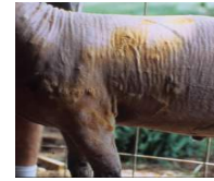
Figure 5 Ringworm lesions

of the hair shaft. Close shearing and washing practices used at shows leave show animals at risk.