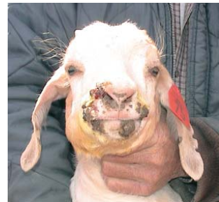
Figure 3 Sore Mouth (Contagious Ecthyma, Orf) sores on lips and muzzle of young goat. http://www2.luresext.edu/goats/index.htm

The infection is self-limiting, with most animals developing protective immunity, however reinfection is possible .