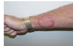
Figure 6 Ringworm lesion on an arm of a handler

People treating animals should always wear gloves and protective clothing to prevent from getting this disease. This is considered a zoonotic disease.