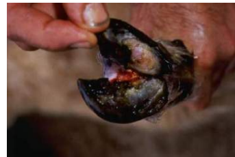
Figure 10 Foot Rot Infection

Foot Rot is a more aggressive progression of foot scald and can occur in one or more feet causing severe lameness. It occurs when both bacteria together cause a dual infection of the tissues of the foot. The foot will become very pink to almost red; the skin between the toes will be slimy and smell foul. This infection can become severe enough to penetrate the hoof wall and sole of the foot resulting in the hoof wall loosening and detaching from the foot if not treated early.