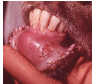
Figure 1 Goat, lower lip, ulcer of Foot and Mouth Disease.

This is a highly contagious disease that can rapidly spread through a region if control and eradication practices are not put into place as soon as the disease is identified. It primarily affects cloven-hoofed domestic and wild animals including cattle, pigs, sheep, and goats.